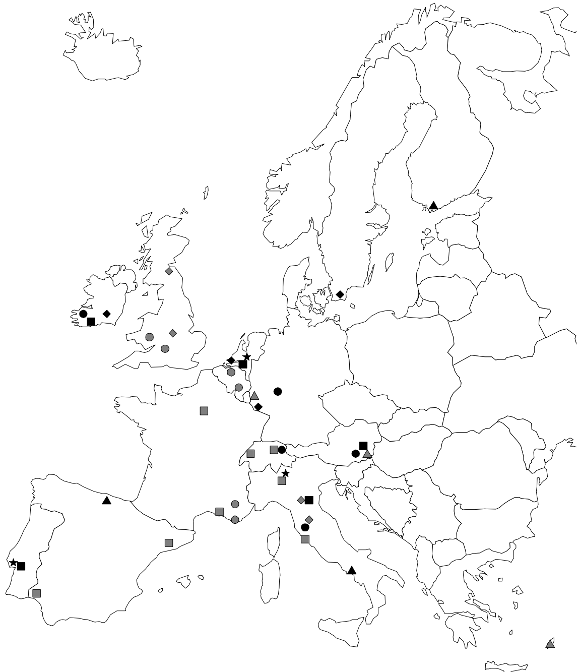
Figure 1: Geographic location of the case studies in the projects analysed